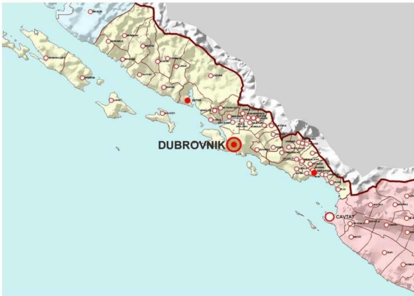
Slika 2. Položaj Grada Dubrovnika